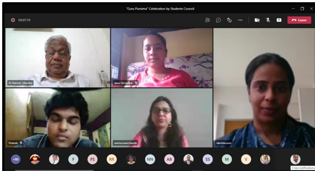
Online Guru Purnima celebration

Principal B. K. Birla College of Arts, Science & Commerce (Autonomous), Kalyan.