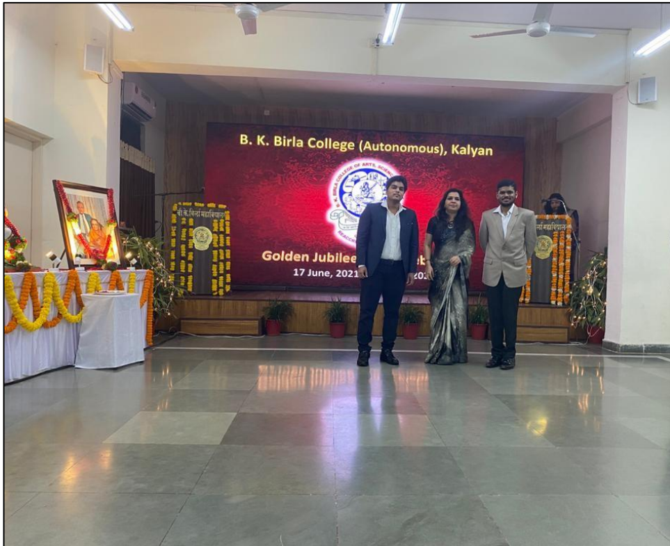
Student Representatives during Golden Jubilee Year celebration