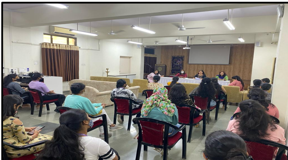
Students' Council Meeting